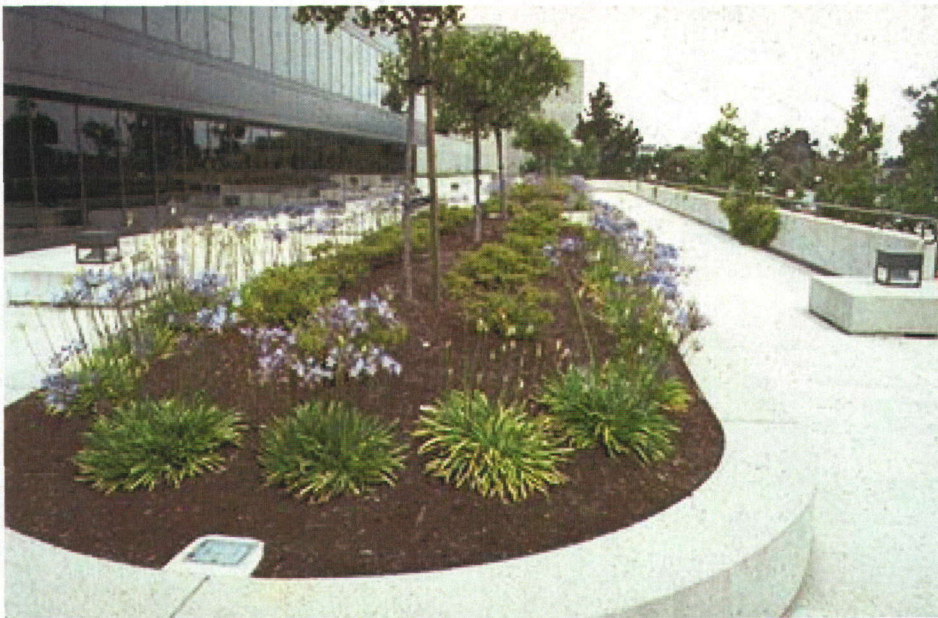
Plantings surrounded by heat-absorbing surfaces, reflective surfaces, or exposed to particularly windy conditions would be assigned a high microclimate value (1.1 - 1.4).

In a “high” microclimate condition, site features increase evaporative conditions. Plantings surrounded by heat-absorbing surfaces, reflective surfaces, or exposed to particularly windy conditions would be assigned high values. For example, plantings in street medians, parking lots, next to southwest-facing walls of a building, or in “wind tunnel” areas would be assigned to the high category.