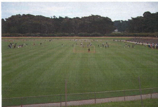
Water requirements of both cool and warm season turfgrasses have been established (see Table 1).

Water requirements for agricultural crops and turfgrasses have been established in laboratory and field studies by measuring plant water loss (evapotranspiration). The total amount of water lost during a specific period of time gives an estimate of the amount needed to be replaced by irrigation. Since growers and turf managers are not equipped to measure plant water loss in the field, a formula was developed which allows water loss to be calcu-