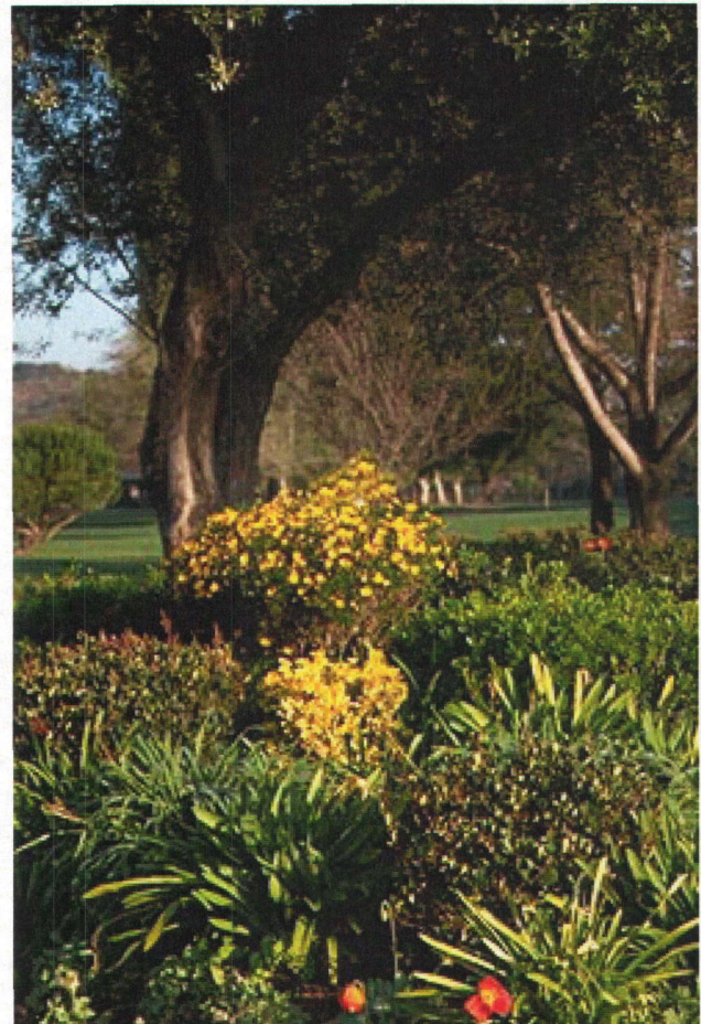
Applying only the amount of water landscape plants need to remain healthy and attractive is an efficient use of a natural resource.