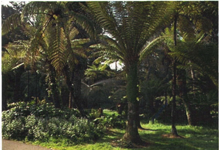
Certain species, such as tree ferns ( Dicksonia antarctica and Cyathea cooperi ), require relatively large amounts of water to maintain health and appearance.

Example: A landscape manager in Pasadena is attempting to determine the water requirements of a large planting of Algerian ivy. In using the ETL formula, the manager realizes a value for the species factor ( k_s ) is needed in order to calculate the landscape coefficient ( K_L ). Using the WUCOLS list (Part 2), the manager looks up Algerian ivy ( Hedera canariensis ) and finds it classified as “moderate” for the Pasadena area, which means that the value ranges from 0.4 to 0.6. Based on previous experience irrigating this species, a low range value of 0.4 for k_s is chosen and entered in the K_L formula. (If the manager had little or no experience with the species, a middle range value of 0.5 would be selected.)