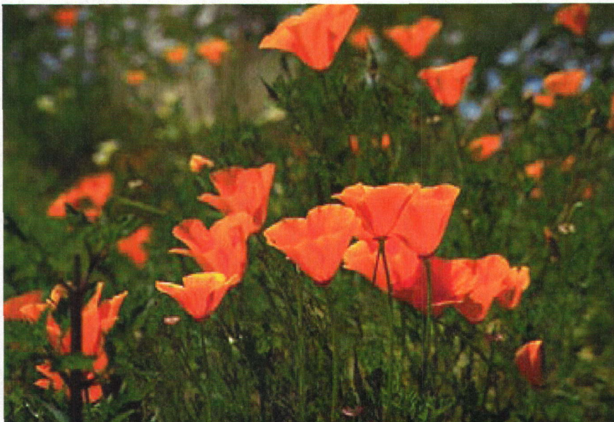
Eschscholzia californica , California poppy

These two publications are companion documents and are intended to be used together.