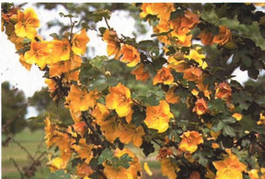
Some species, such as flannel bush ( Fremontodendron spp.), need very little irrigation water to maintain health and appearance.

Although the above example is straightforward, the assignment of species factors to plantings can be difficult. Refer to “Assigning Species Factors to Plantings” for guidance in making k_s assignments.