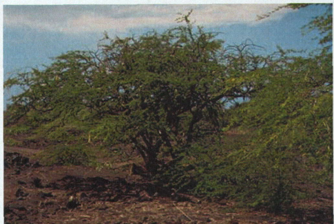
Some desert species, such as mesquite ( Prosopis glandulosa torreyana ), have been found to maintain ET rates equivalent to temperate zone species when water is available (Leviitt et al 1995). When soil moisture levels decrease, however, ET rates in desert species decline rapidly.

The ET_L formula calculates the amount of water needed for health, appearance and growth, not the maximum amount that can be lost via evapotranspiration.