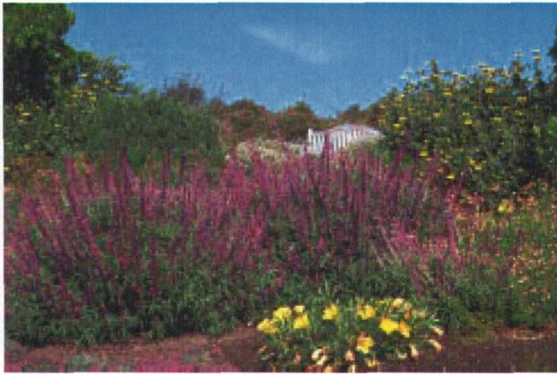
Cover photo: The Garden at Heather Farms, Walnut Creek, CA

This Guide is a free publication. Additional copies may be obtained from: