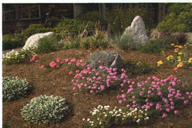
For shrubs and groundcovers, canopy cover less than 90% constitutes a density less than average ( k_d < 1.0 ). This mixed planting would be assigned a low density value (0.5 - 0.9).

The microclimate factor is relatively easy to set. An “average” microclimate condition is equivalent to reference evapotranspiration conditions, i.e., an open-field setting without extraordinary winds or heat inputs atypical for the location. This microclimate is not substantially affected by nearby buildings, structures, pavements, slopes, or reflective surfaces. For example, plantings in a well-vegetated park which are not exposed to winds atypical of the area, would be assigned to the average microclimate category.