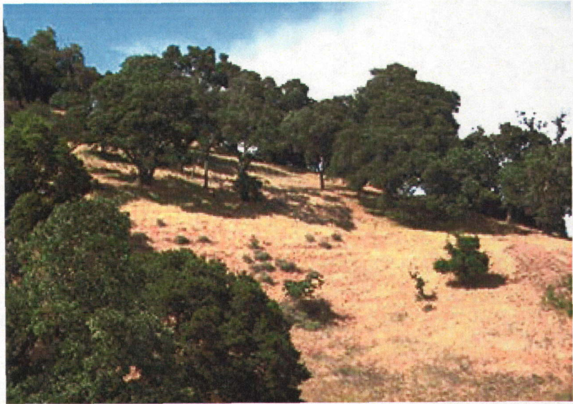
Certain species, such as these coast live oak ( Quercus agrifolia ), can maintain health and appearance without irrigation (after they become established). Such species are grouped in the “very low” category and are assigned a species factor of less than 0.1. Many California native species are in this category.