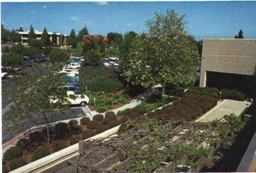
Unlike agricultural crops or turfgrass, landscape plantings are typically composed of many species. Collections of species are commonly irrigated within a single irrigation zone, and the different species within the irrigation zone may have widely different water needs. Using a crop coefficient for one species may not be appropriate for the other species.

ferent species within the irrigation zone may have widely different water needs. For example, a zone may be composed of hydrangea, rhododendron, alder, juniper, oleander, and olive. These species are commonly regarded as having quite different water needs and the selection of a crop coefficient appropriate for one species may not be appropriate for the other species. Crop coefficients suitable for landscapes need to include some consideration of the mixtures of species which occur in many plantings.