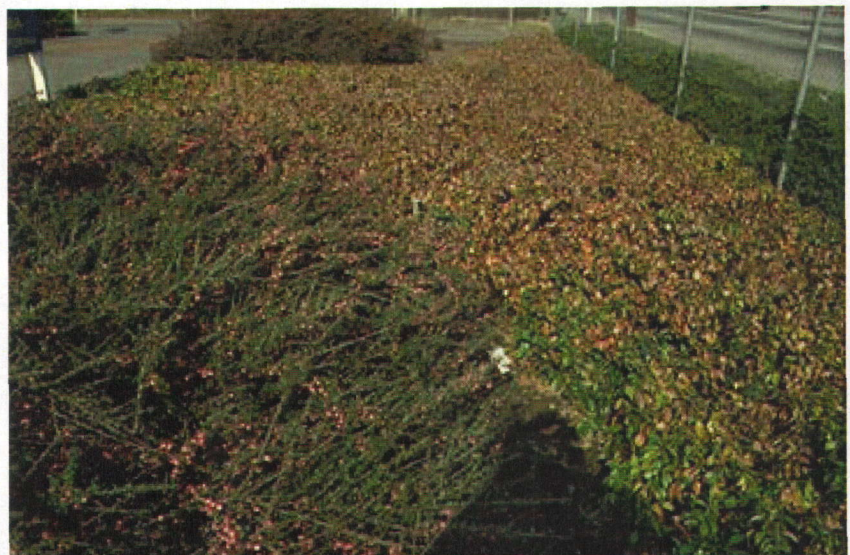
Plant injury may occur when species with different water needs are planted in a single irrigation zone. During a drought, irrigation was withdrawn from this planting of star jasmine ( Trachelospermum jasminoides ) and cotoneaster ( Cotoneaster sp). Subsequently, star jasmine was severely injured, while cotoneaster was not visibly affected.

Considering that plantings with mixed water needs are not water-efficient in most cases and