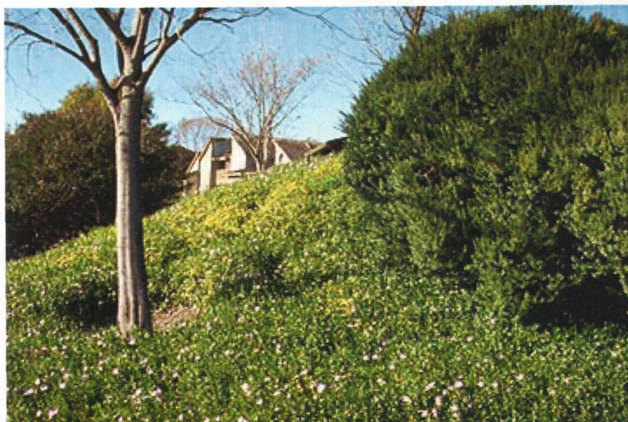
Landscapes are frequently composed of plants of various heights: trees, groundcovers, and shrubs. Due to the typical growth form of each vegetation type, "tiers" of vegetation result. Plantings with more than one tier are likely to lose more water than a planting with a single tier. Here, the trees and shrubs in the groundcover represent a higher water loss condition than if the groundcover occurred alone. The density factor accounts for differences in vegetation density.

In most cases, the presence of vegetation tiers in landscapes constitutes a high density condition. For example, a planting with two or three tiers and complete canopy cover would be considered to be in the high ka category .