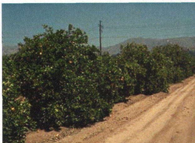
Water requirements of many agricultural crops have been established (see Table 1).

lated. This formula (referred to as the ET_c formula) is written as follows: