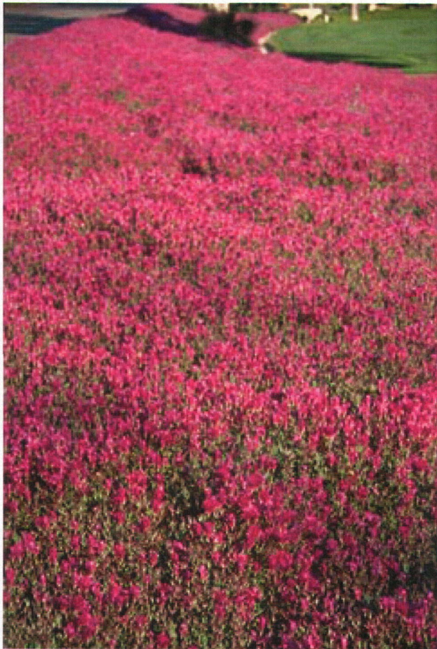
Plantings of a single species, such as this iceplant groundcover ( Drosanthemum sp), are considered to have average density ( k_a = 1.0 ) when full (90 - 100% cover).

Plantings of one vegetation type: for trees, canopy cover of 70% to 100% constitutes an average condition. For shrubs or groundcovers, a canopy cover of 90% to 100% is considered to be an average condition.