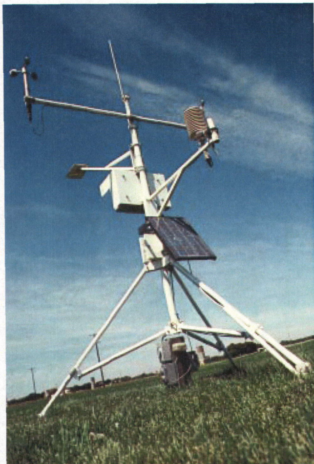
A specialized weather station (CIMIS station) or a Class A evaporation pan (background) can be used to determine reference evapotranspiration (ET c ) for a site. Daily CIMIS data is available online at www.cimis.water.ca.gov .

The crop coefficient (K c ) is determined from field research. Water loss from a crop is measured over an extended period of time. Water loss and estimated reference evapotranspiration are used to calculate K c as follows: