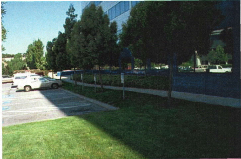
Plantings that are shaded for a substantial part of the day, or are protected from winds typical to the area, are assigned low microclimate values (0.5 - 0.9). This planting on the northeast side of the office building is shaded for several hours each day.

Site conditions equivalent to those used for reference ET measurements represent an average microclimate. Reference ET is measured in an open-field setting which is not exposed to extraordinary winds or heat inputs from nearby buildings, structures, or vehicles. Plantings in similar conditions would be considered to be in an average microclimate. Plantings in park settings are most typically assigned to this category. Although some hardscape may exist, vegetation dominates the landscape. Large plantings of groundcover, groves of trees, and mixtures of shrubs, turf, and trees in relatively open ar-