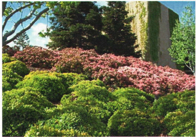
This mixed planting of Wheeler's pittosporum ( Pittosporum tobira 'Wheeler's Dwarf'), Indian hawthorne ( Raphiolepis indica ), American sweetgum ( Liquidambar styraciflua ), and coast redwood ( Sequoia sempervirens ) is considered to be average density ( k_d = 1.0 ). Trees are widely spaced through the sub-shrub/groundcover planting area.

Plantings of more than one vegetation type: for mixed vegetation types, an average density condition occurs when one vegetation type is predominant while another type occurs occasionally in the planting, and canopy cover for the predominant vegetation type is within the average density specifications outlined above. For example, a mature groundcover planting (greater than 90% canopy cover) which contains trees and/or shrubs that are widely spaced would be considered to be average density. Additionally, a grove of trees (greater than 70% canopy cover) which contains shrubs and/or groundcover plants which are widely spaced would constitute an average condition.