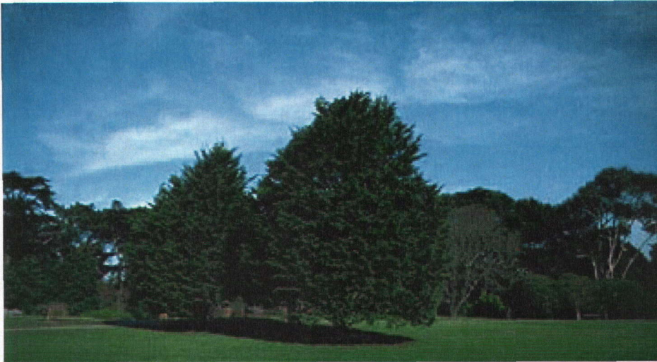
Plantings in a well-vegetated park, which are not exposed to winds atypical for the area, would be assigned to the average microclimate category ( k_{mc} = 1.0 ). These conditions are similar to those used for reference evapotranspiration measurements (CIMIS stations).

In a “high” microclimate condition, site features increase evaporative conditions. Plantings surrounded by heat-absorbing surfaces, reflective surfaces, or exposed to particularly windy conditions would be assigned high values. For example, plantings in street medians, parking lots, next to southwest-facing walls of a building, or in “wind tunnel” areas would be assigned to the high category.